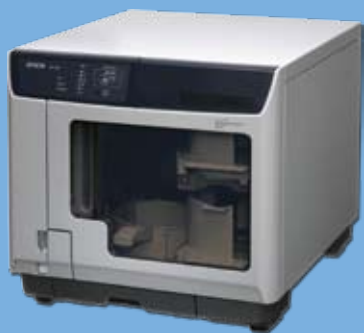
EPSON PP-100 CD/DVD autoloader